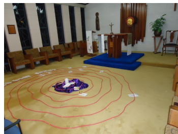
The Cosmic Walk

The Cosmic Walk was just one of the interesting sessions of the Weekend. It was a way of bringing our knowledge of the of the 13.7 -billion year Universe process from our heads to our hearts. A spiral representing the entire 13.7 billion years of cosmic and evolutionary journey was