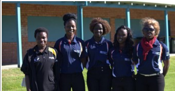
Edmund Rice Centre Youth Leaders from the Butler and Mirrabooka groups helping at the Multicultural AFL Gala Day, June 2013

The Edmund Rice Centre Youth Leadership Group has been very busy dedicating their time to running Edmund Rice Sports Programs and helping the community.