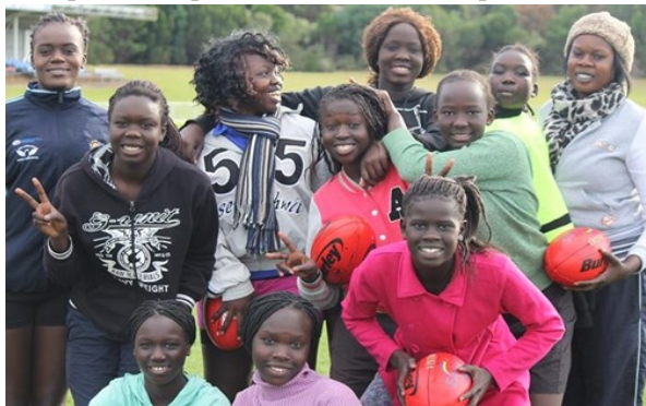
Butler Falcons High Performance AFL Camp, July 2013

Please help us to promote this commercial as widely as possible. WATCH it, LIKE it and SHARE it to do your part in positive promotion of multiculturalism in sport and in Australia.