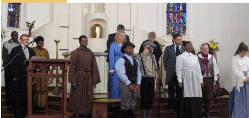
Below — the cast from the Edmund Rice Trail Performance WA

Thank you to all the actors, The Pipe Band, CBC Jazz Band and all who helped in different ways to make the day a success.