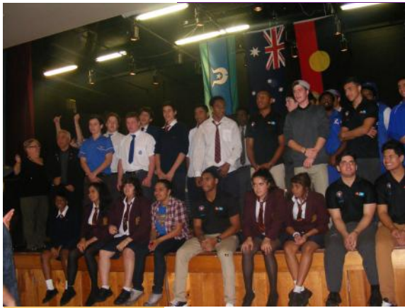
'The Crew' who attended FIER 2 in Queensland