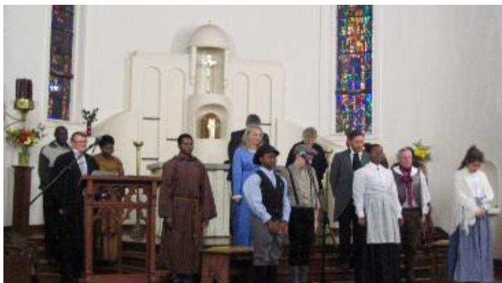
The actors in the Edmund Rice Trail volunteered from wide-ranging ERN ministries