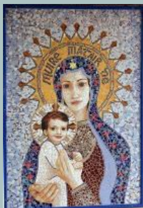
Madonna and Child Mosaic— Trinity College Perth