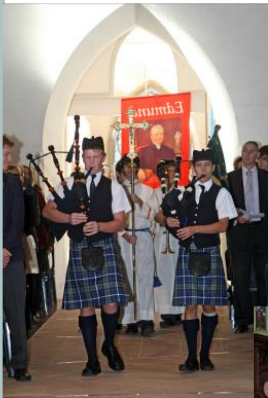
Trinity Pipes lead the Procession into St Mary's Cathedral Perth WA