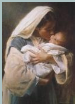
We celebrate the month of Mary