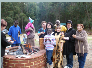
Gathered around the campfire at Harmony Weekend 2009

Coming soon :- ERCKWA QUIZ NIGHT 18 June 2010