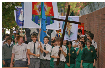
WYD celebrations at Trinity College

Groups are also attending from ERCKWA & the Edmund Rice Community Salter Point.